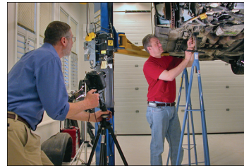
Bentley technical editors documenting fuel filter replacement